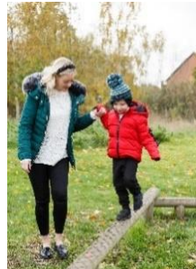
Enjoy physical activities together