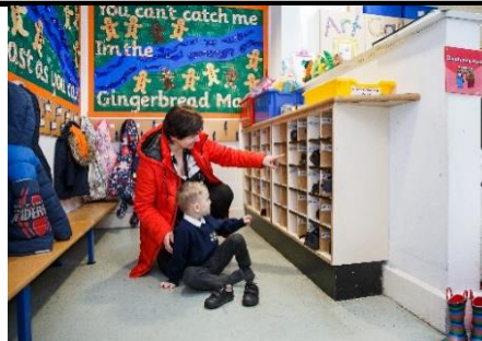
Support your child to do things by themselves