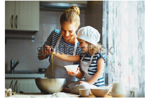
Have fun exploring maths