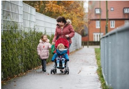
Communicate and talk with your child