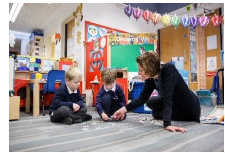
Encourage your child to talk and play with others