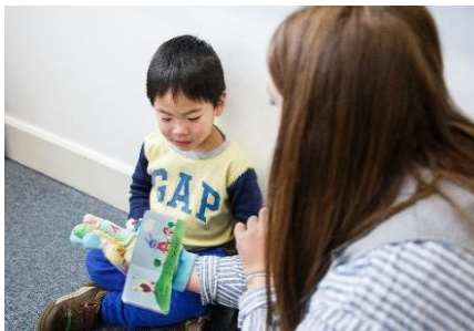
Read, tell and make up stories together